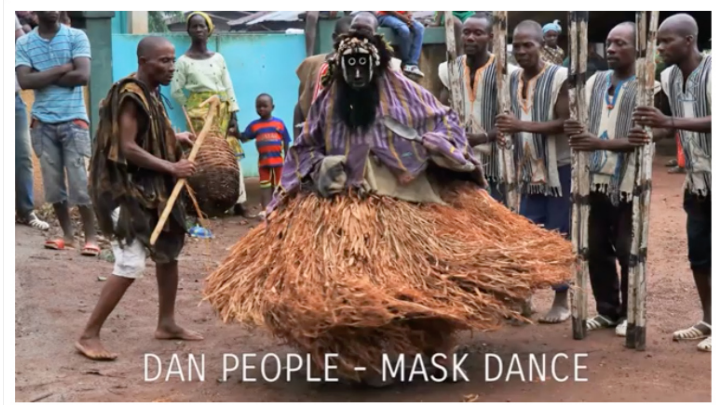
DAN PEOPLE - MASK DANCE

I youtube searched "Dan People Dance MASK"